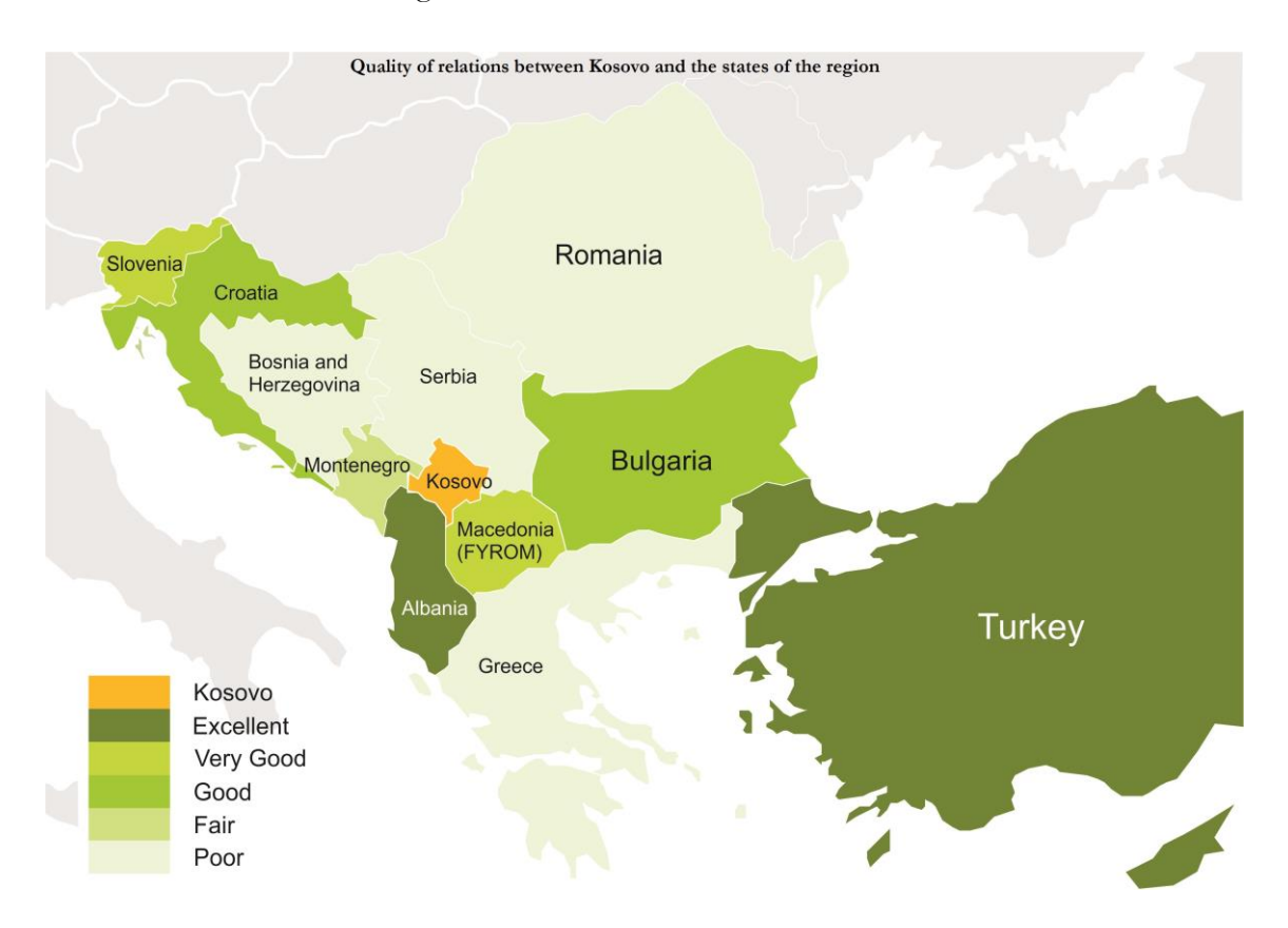
What mostly contributes to Macedonia having very good bilateral relations as compared to Montenegro which has fair bilateral relations with Kosovo, is the number of agreements that each of them has signed with Kosovo. Macedonia ranks third among the countries of the region with the number of agreements signed with Kosovo, 16 in total, while Montenegro ranks eighth in the region, or the last among those who have recognized Kosovo, in terms of the number of agreements it has signed with Kosovo, which are only 3 in total. Macedonia and Montenegro have had only modest investments in Kosovo, and do not contribute much on the quality of relations between them and Kosovo maintains only moderately intensive relations with Macedonia, and no active relations with Montenegro, which is surprising given that these two states are Kosovo's immediate neighbours. Moderately intensive relations between Kosovo and Macedonia derive mostly from economic activity, rather than political activity among the two states, while with Montenegro, both, political and economic activity lags behind.

because they feared they would ruin their relations with Serbia, especially the mutual economic interdependence. As such, it took some of the Western powers, including key EU and NATO Member States to apply some pressure and entice them with swifter accession process in order to make them move on with recognition. The Albanian community in Macedonia also played a role, and regional security and stability was taken into account throughout this process. Unlike, Turkey and Albania, Macedonia and Montenegro have built conditional bilateral relations with Kosovo. For, instance, Montenegro did not want to upgrade its diplomatic representation unless Kosovo upgrades the status of Kosovo Montenegrins to a constitutional community - equal to the constitutional rights the other communities in Kosovo enjoy. Similarly, Macedonia did not want to establish diplomatic relations, unless Kosovo would agree on border demarcation, and so on.